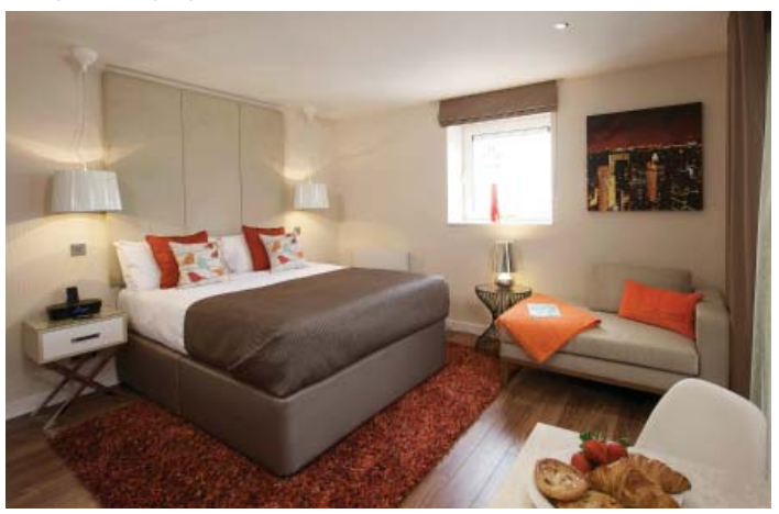
FRASER PLACE CANARY WHARF

Secondly, distance plays an important role in the slower growth of the serviced apartment market. In the USA, the distance between the East and West Coast is about 4.800 km, which equates to a five-hour plane ride. This makes it almost impossible to fly home to the East Coast for the weekend while working on a project in California. Flying from London to Berlin, however, is only about 1,000 km with a flight time of 1.5 hours and can easily be done in a day. Hence, the trend for individuals working on projects in Europe is to return home more frequently, whereas business people employed on projects in the USA have a harder