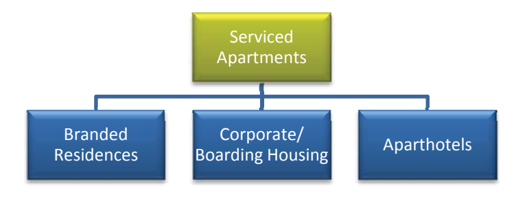
FIGURE 1 THE THREE TYPES OF SERVICED APARTMENTS

While there is no official definition, we consider the term 'serviced apartment' to be an umbrella term that can be broken down into three sub-categories: branded residences, corporate/boarding housing and aparthotels. Figure 2 gives a broad comparison of the three sub-categories.